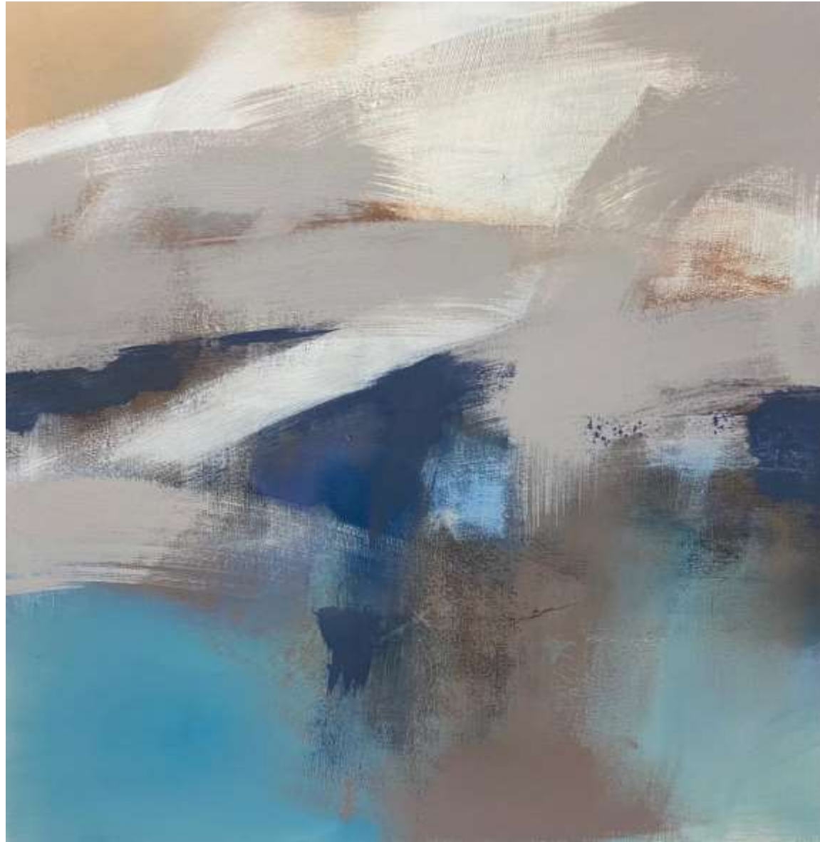
Gesto 14 Oil on Canvas 80x80cm Unique Piece 2021