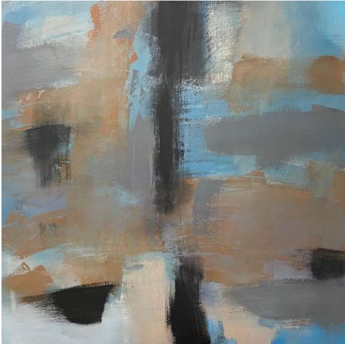
Gesto 16 Oil on Canvas 80x80cm Unique Piece 2021