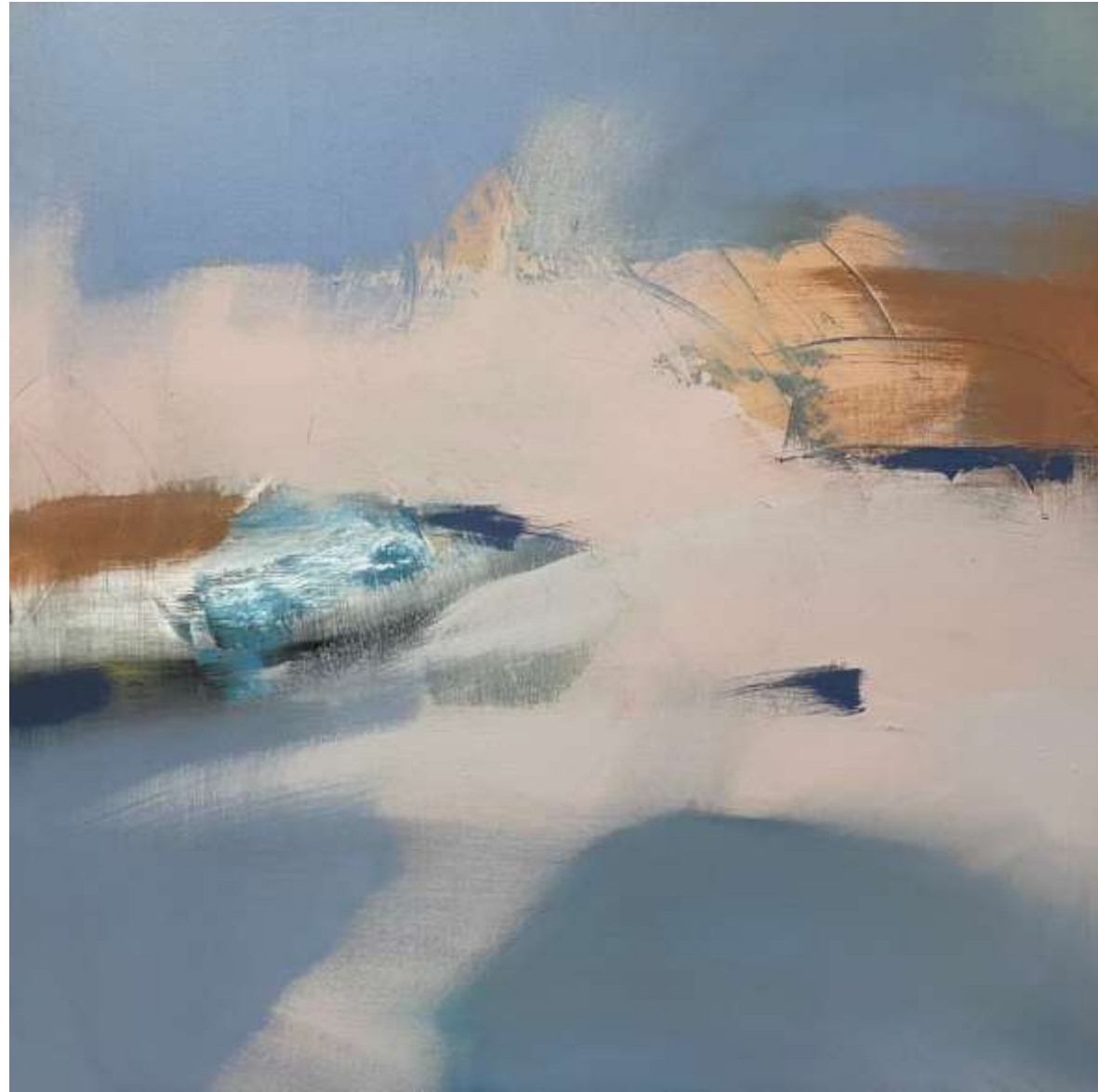
Gesto 15 Oil on Canvas 80x80cm Unique Piece 2021