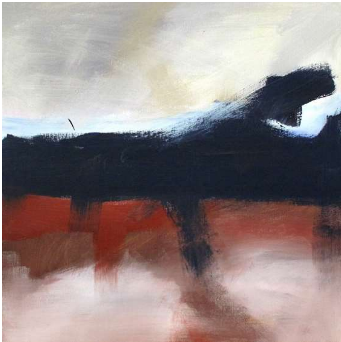
Gesto 06 Acrylic on Canvas 40x40cm Unique Piece 2019