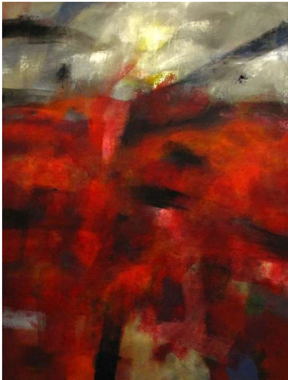
Gesto 65 Oil on Canvas 140x200cm Unique Piece 2019