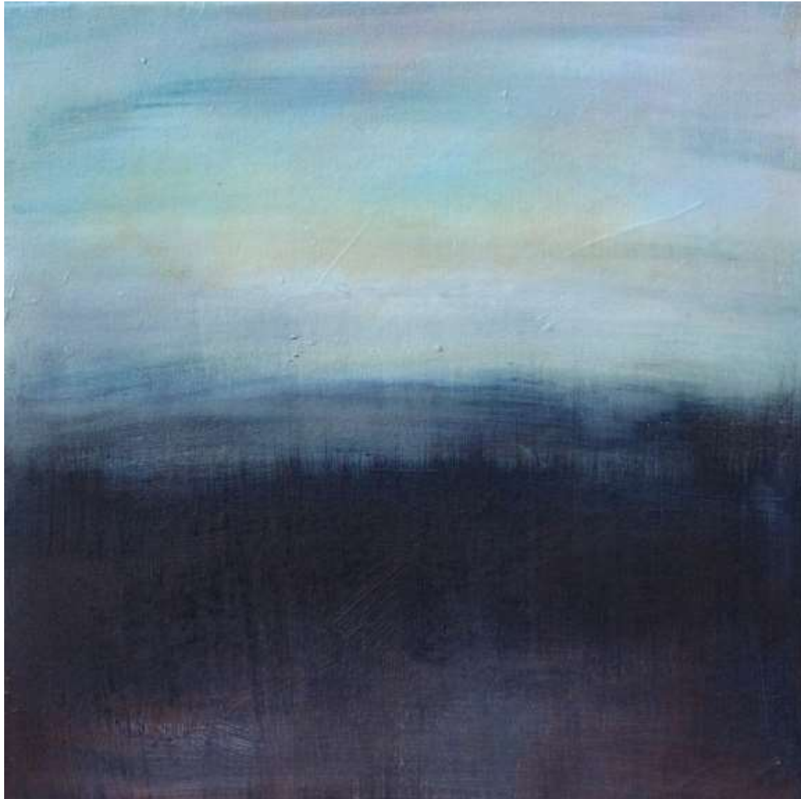
Gesto 02 Acrylic on Canvas 40x40cm Unique Piece 2019