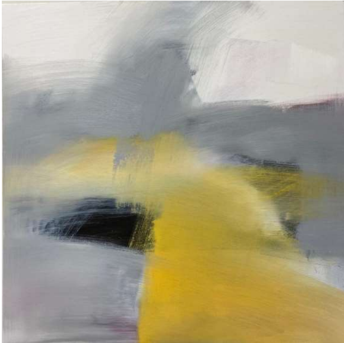
Gesto 13 Oil on Canvas 80x80cm Unique Piece 2021