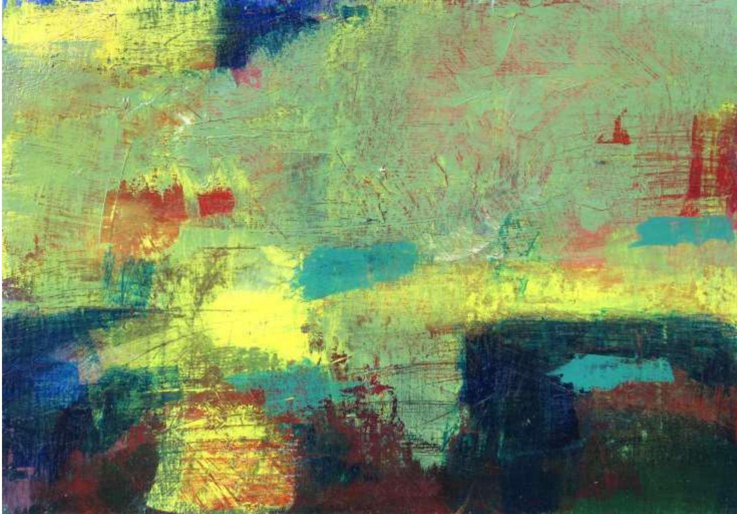
Gesto 27 Oil on Wood 50x35cm Unique Piece 2019