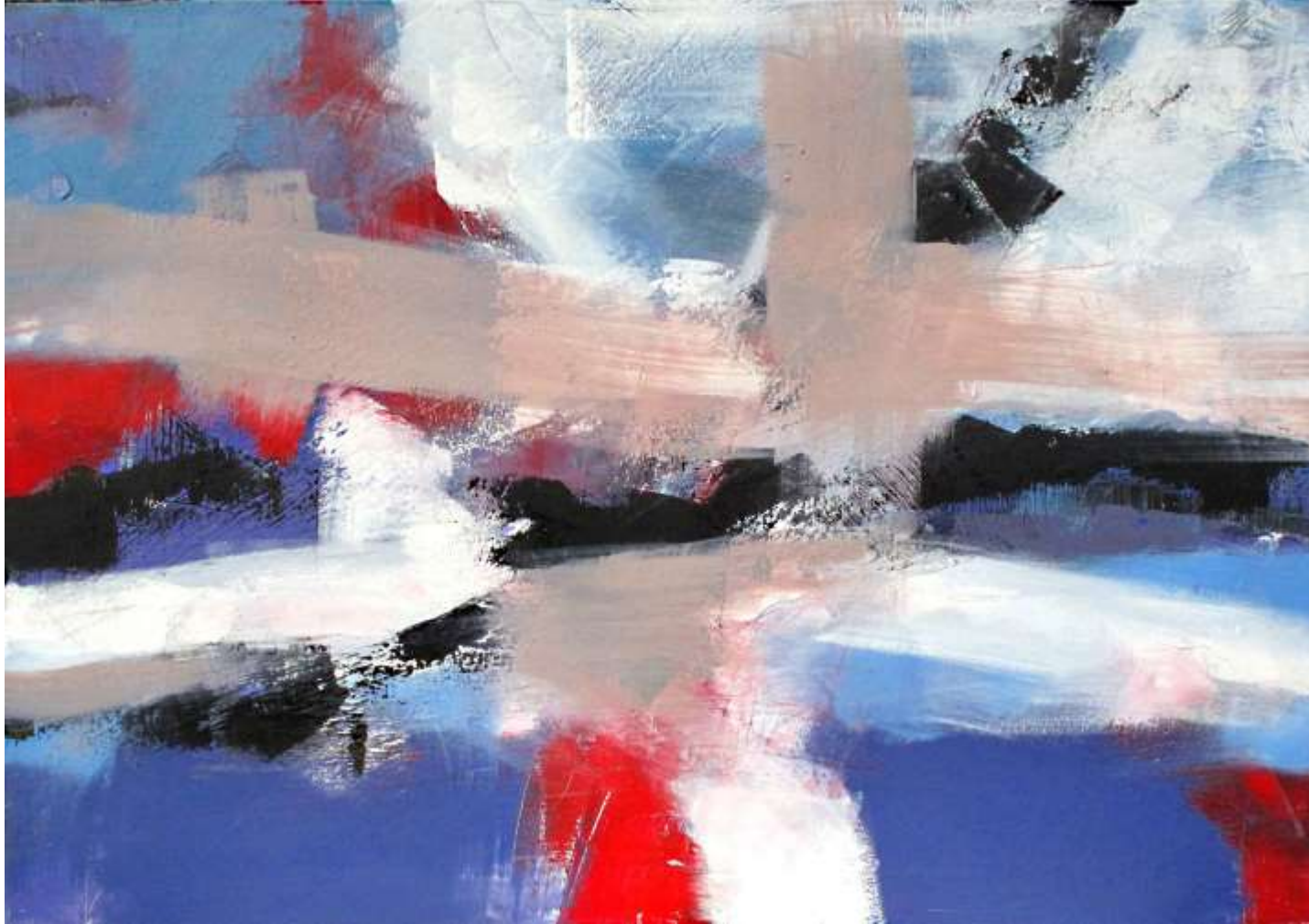
Gesto 60 Oil on Canvas 70x100cm Unique Piece 2019