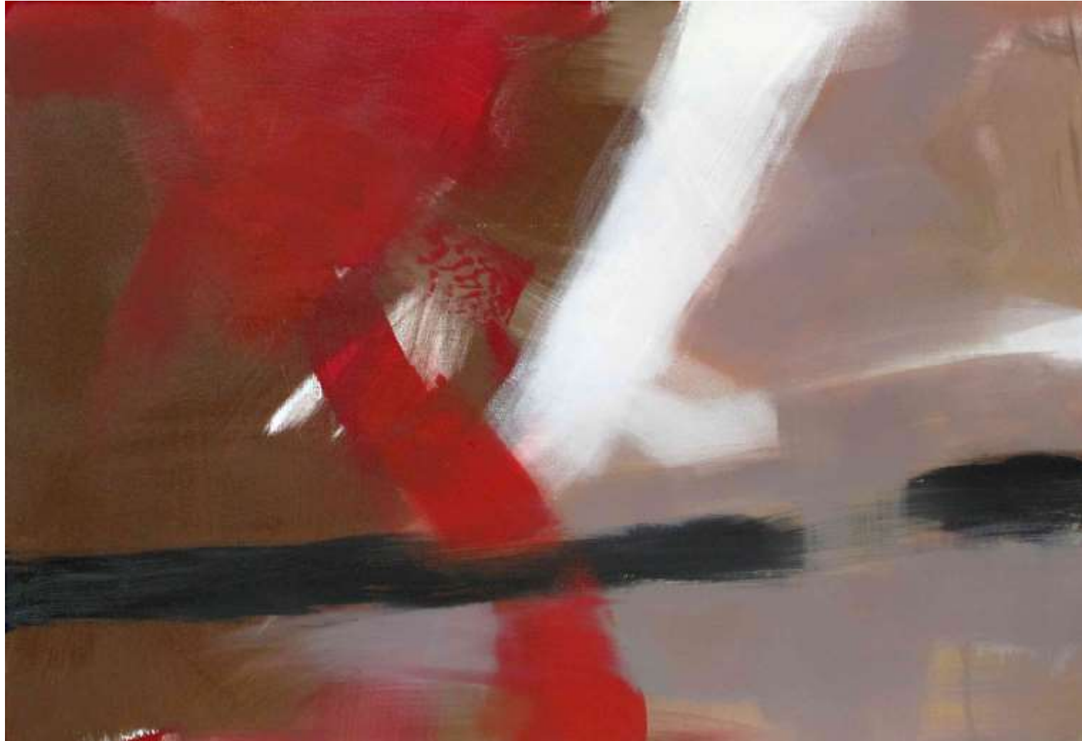
Gesto 80 Oil on Canvas 70x100cm Unique Piece 2019