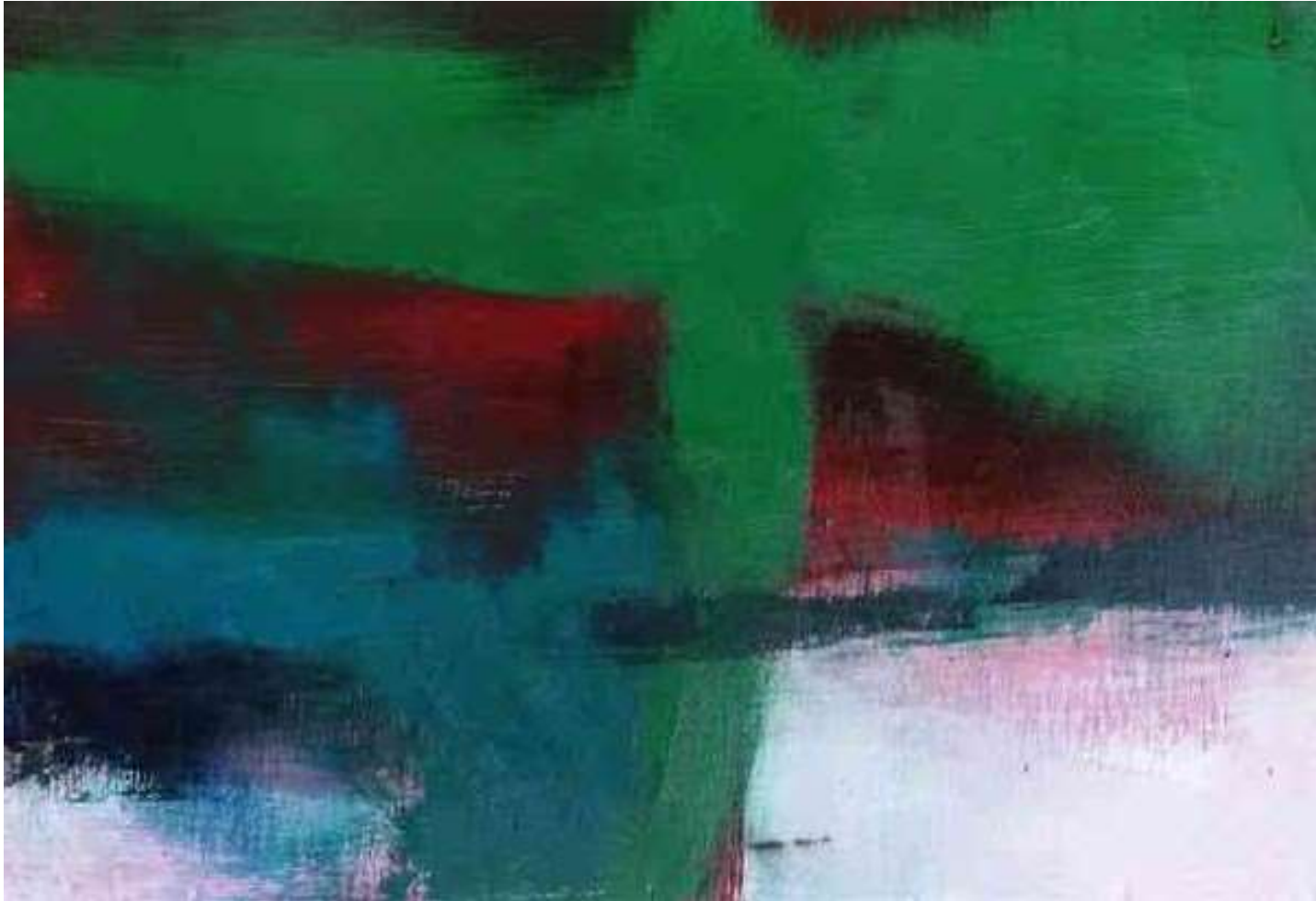
Gesto 22 Oil on Wood 50x35cm Unique Piece 2019