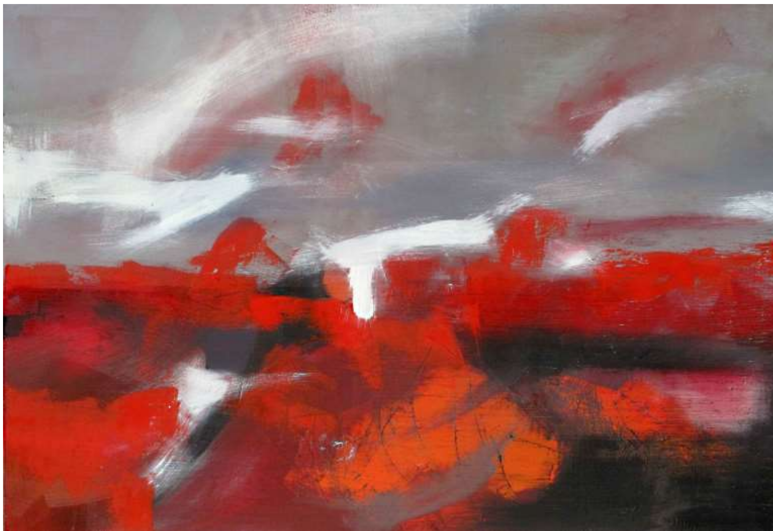
Gesto 79 Oil on Canvas 70x100cm Unique Piece 2019