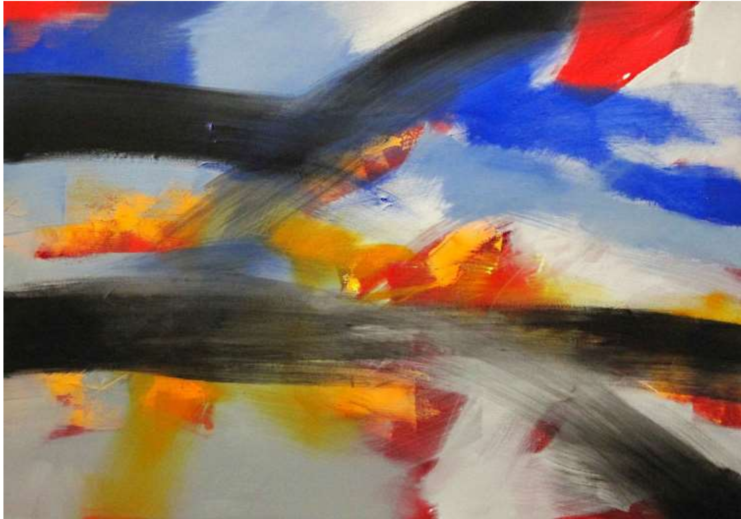
Gesto 78 Oil on Canvas 70x100cm Unique Piece 2019