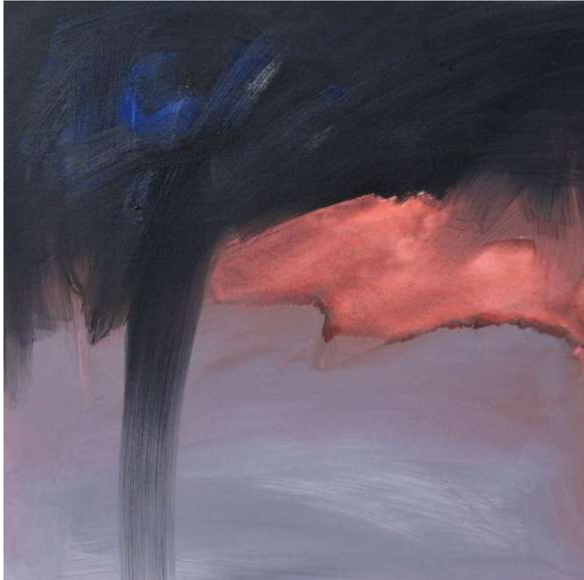
Gesto 03 Acrylic on Canvas 40x40cm Unique Piece 2019