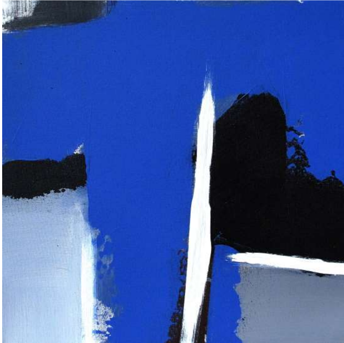
Gesto 40 Acrylic on Canvas 40x40cm Unique Piece 2019