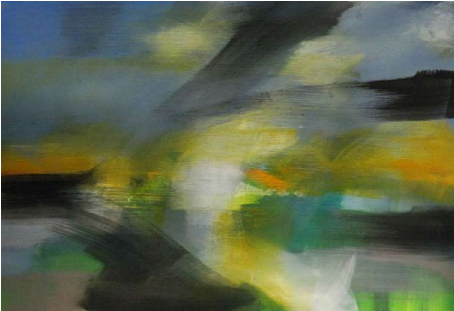
Gesto 5 Oil on Canvas 70x100cm Unique Piece 2019