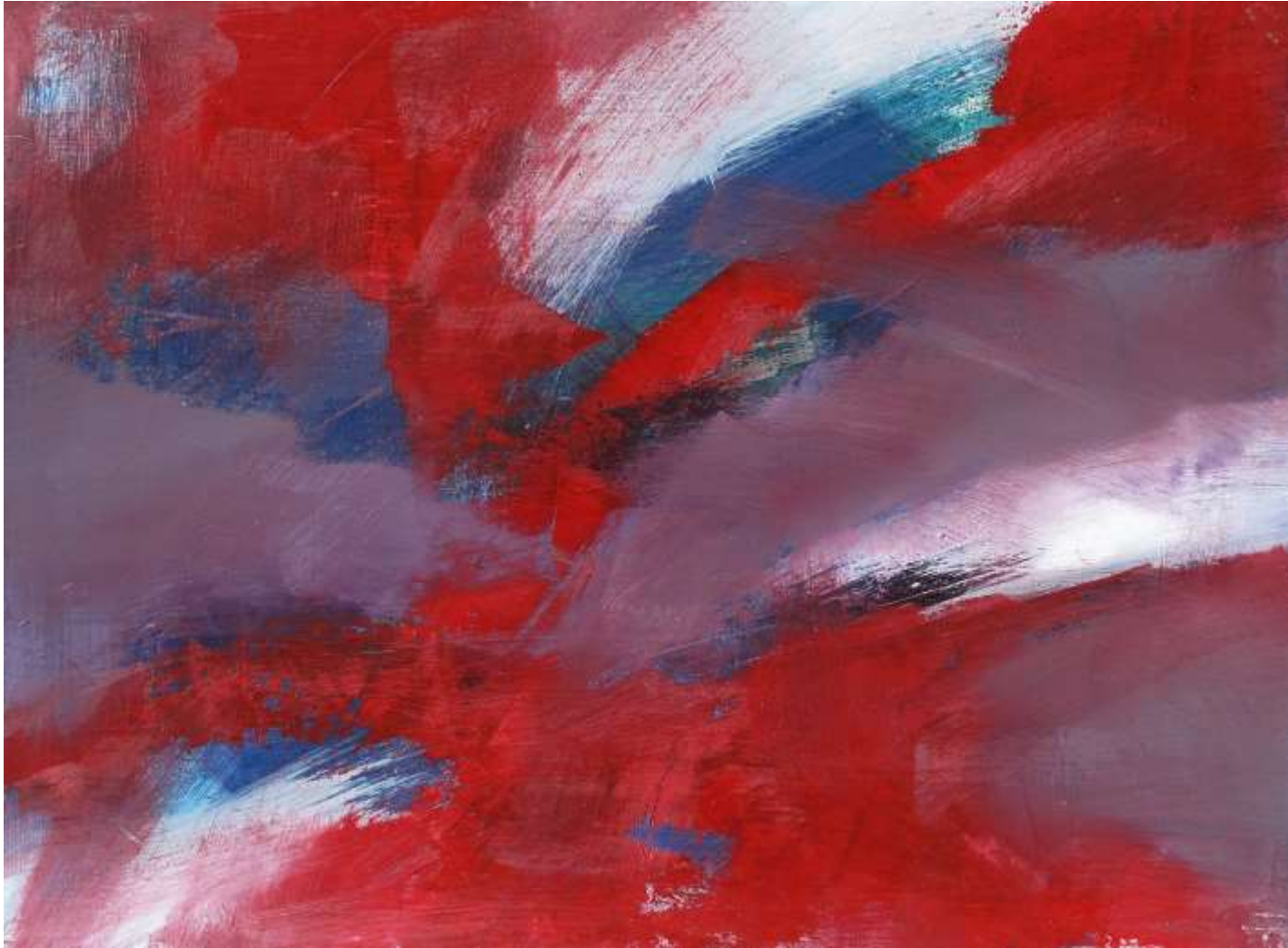
Gesto 28 Oil on Wood 50x35cm Unique Piece 2019